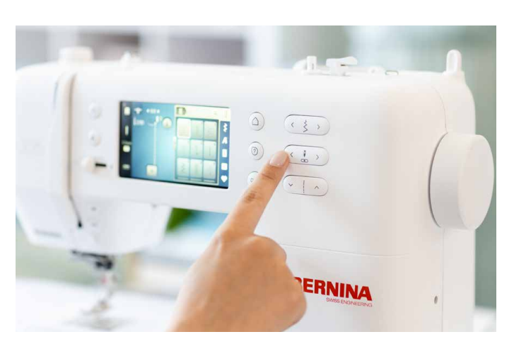
Simple handling via touch screen and direct selection buttons