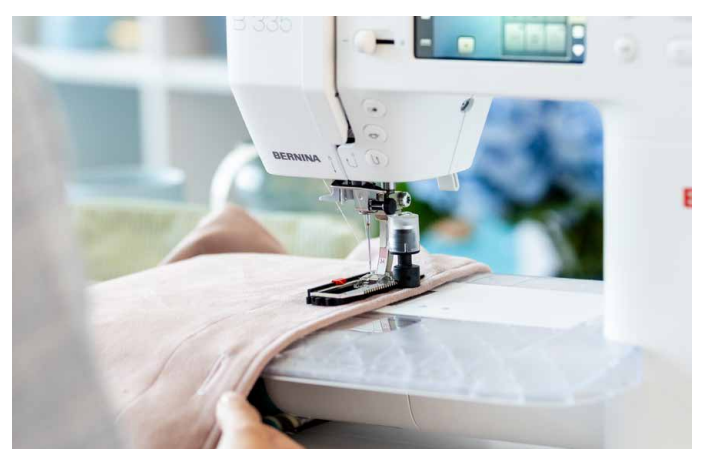
Perfect buttonholes with the Buttonhole Foot with Slide #3A