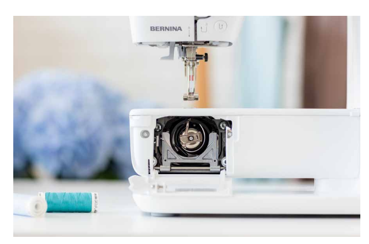
Handling from the front when changing the bobbin