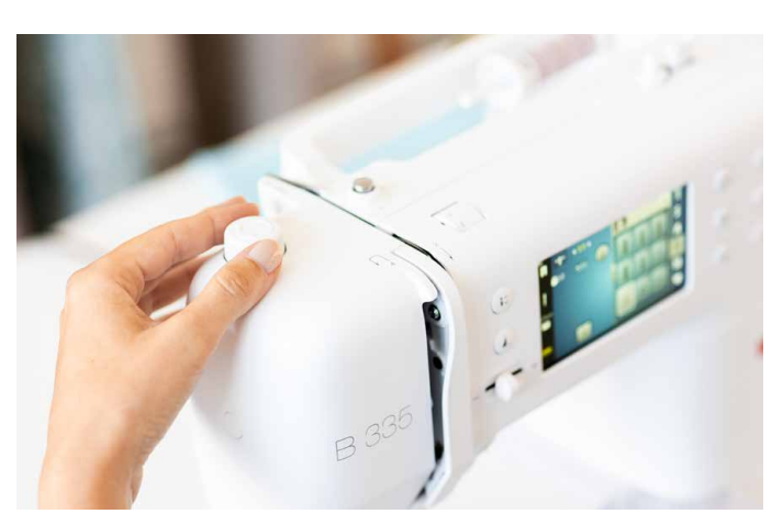
Individually adjustable presser foot pressure